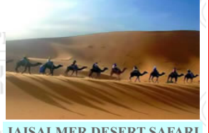
JAISALMER DESERT SAFARI